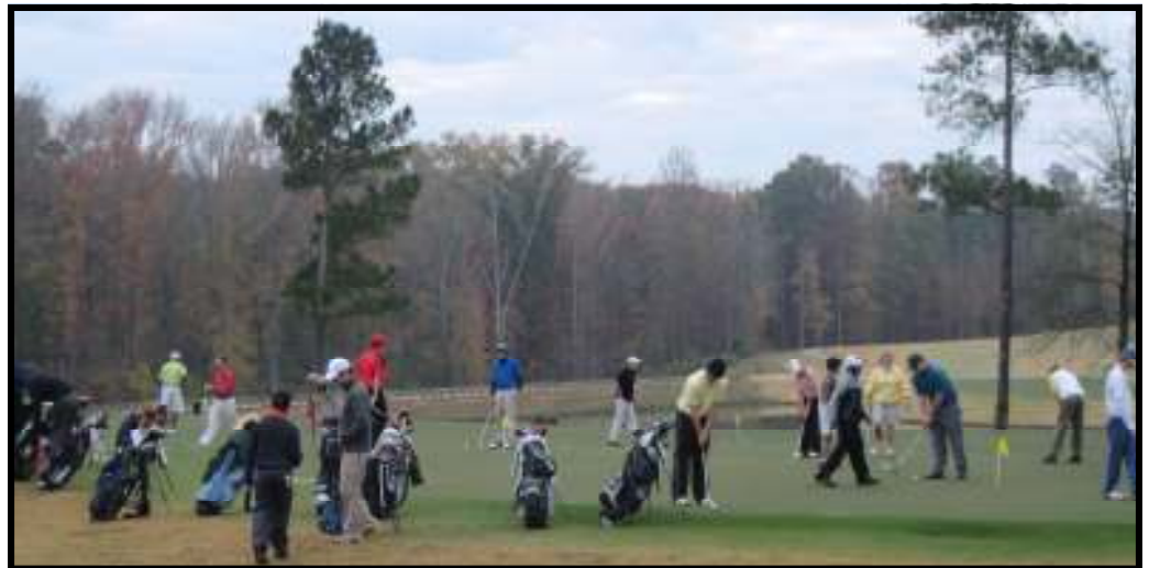
The Practice Green at Bartram Trail Golf Club prior to C.C. J.G.C.