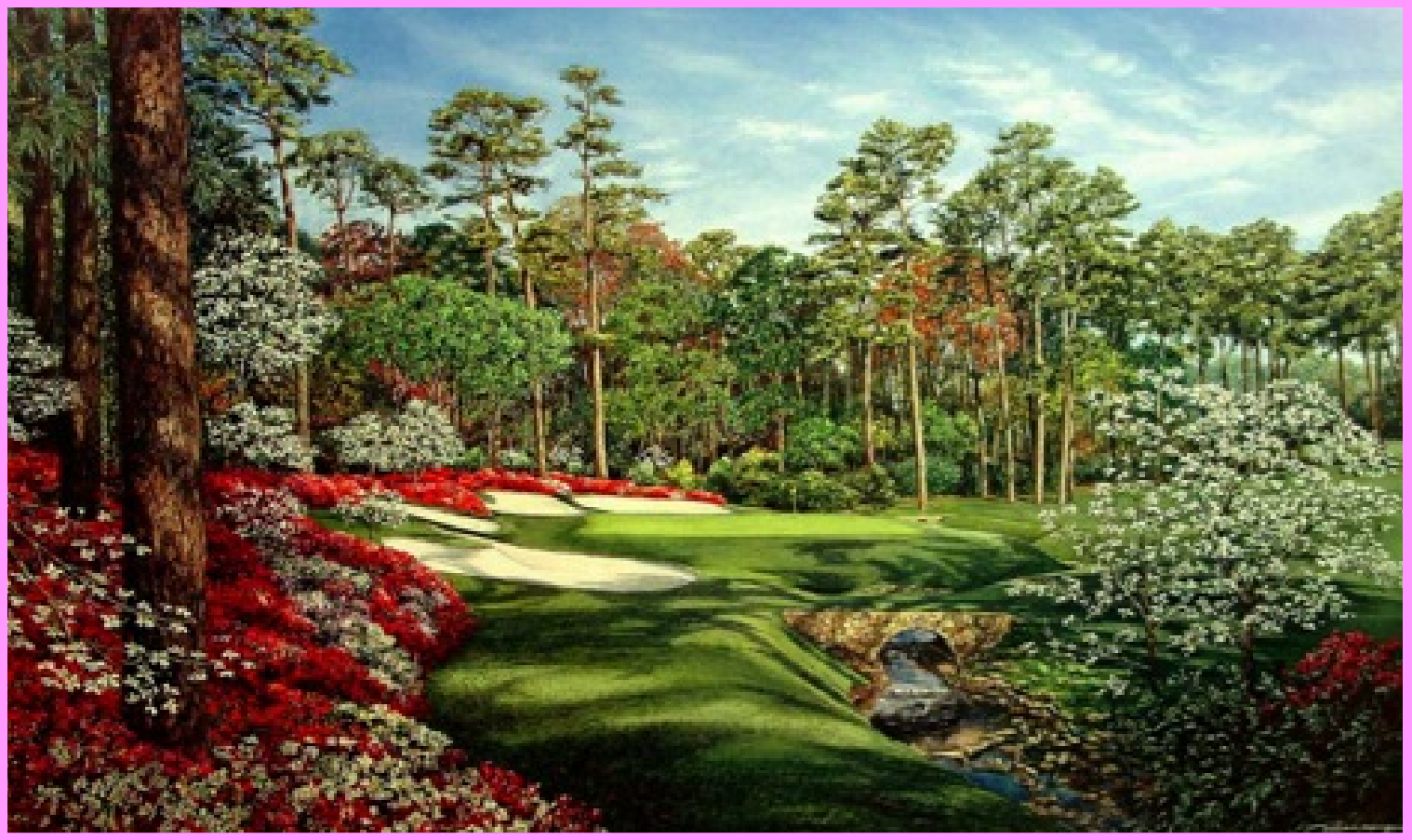
Augusta National No. 13 Azalea