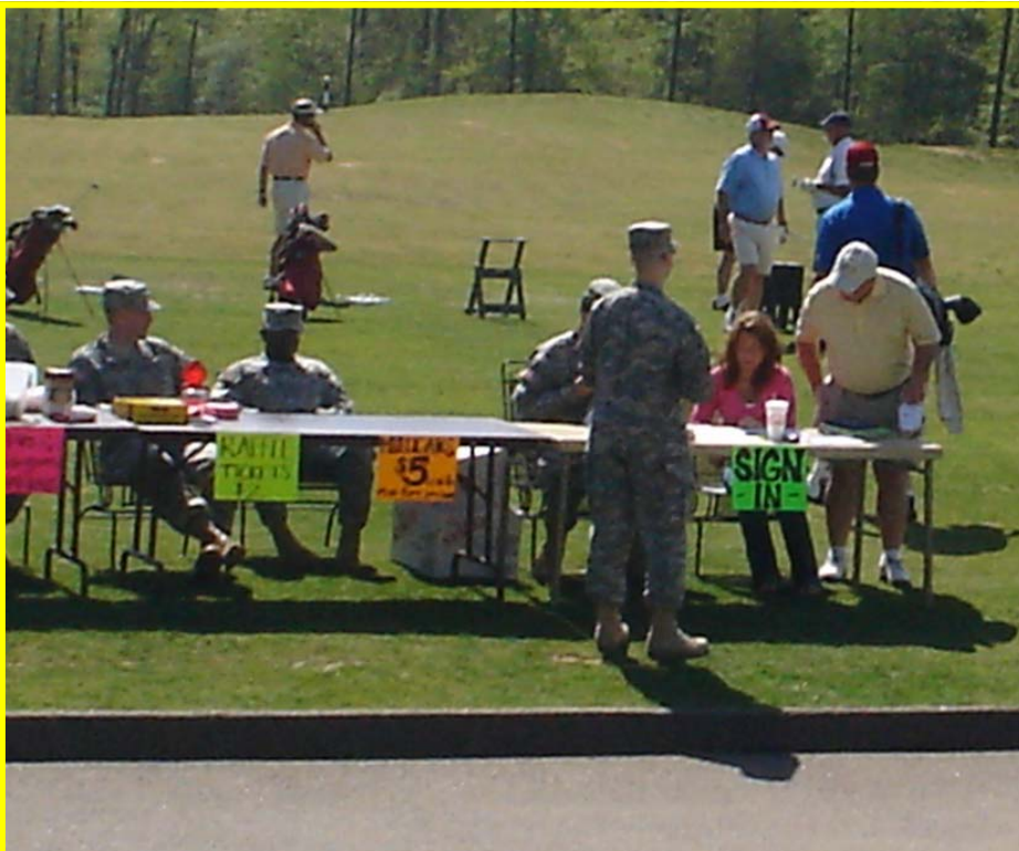
Check-In for the Wounded Warrior Project Golf Tournament At Bartram Trail Golf Club.

CALL THE BARTRAM TRAIL PRO SHOP TO BOOK YOUR NEXT LESSON AT 706-210-4681