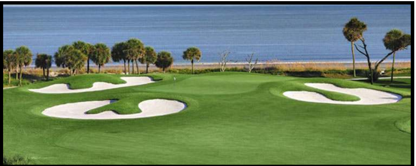
Hilton Head Island