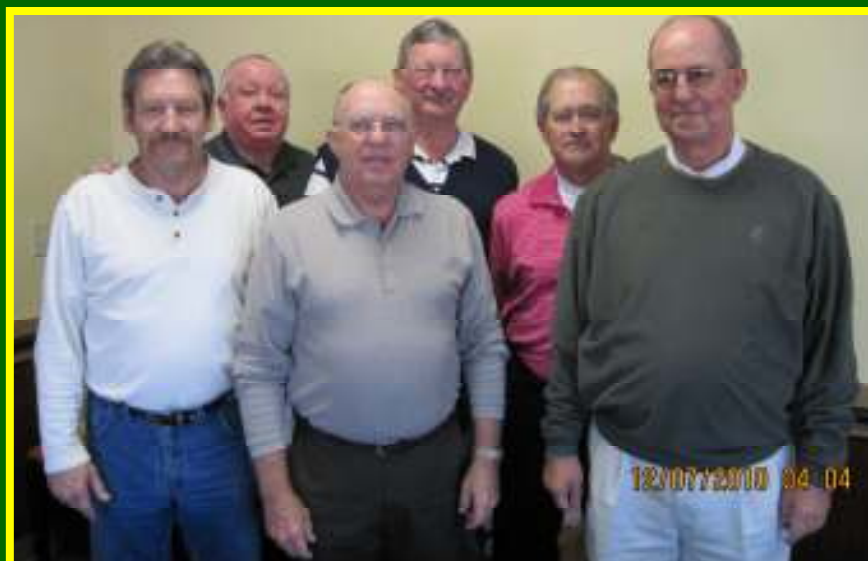
2010 BTSMGA BOARD MEMBERS

We volunteer and provide support for Bartram Trail special events and tournaments.