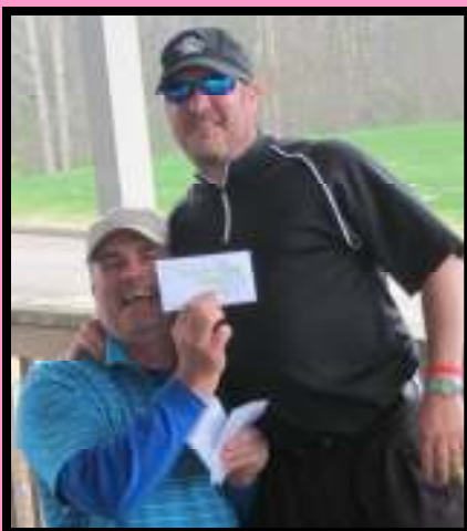
EL Prez A DenTay 2nd Lowest # of shots taken