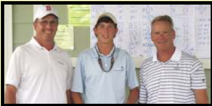
Gove & Gove First Place Team Net