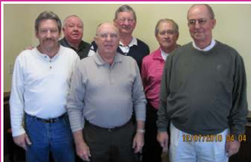
2010 BTSMGA BOARD MEMBERS

We volunteer and provide support for Bartram Trail special events and tournaments.